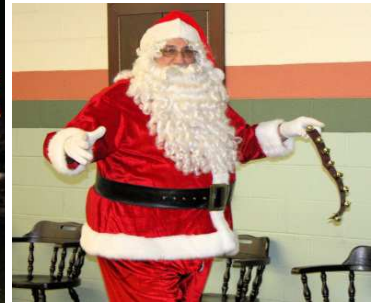
ROMA LODGE HOLIDAY LIGHTING NOVEMBER 22, 2011