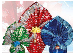
Uova di Pasqua